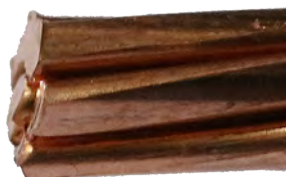
Cut made with special M&P scissors.

7 Insert the connector and fasten accurately until the o-ring present in component A, will be pressed against the connector body. Inside, the rubber component C (pic. 1) will expand, granting optimal sealing against moisture and a perfect contact to ground.