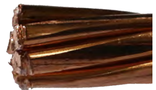
Common scissors: remember to use a file in order to remove the copper in excess. Make sure to follow the stranding direction.